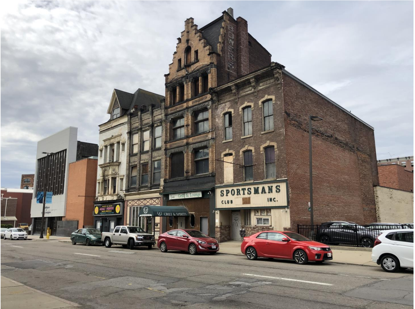
Photo 18. 1421-1501 Market Street, facing southwest