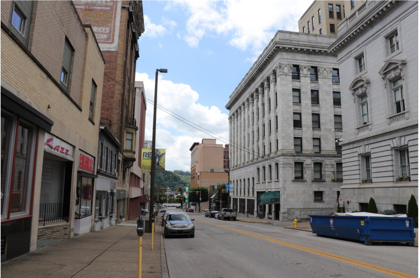
Photo 24. 12th Street between Market and Chapline, facing west