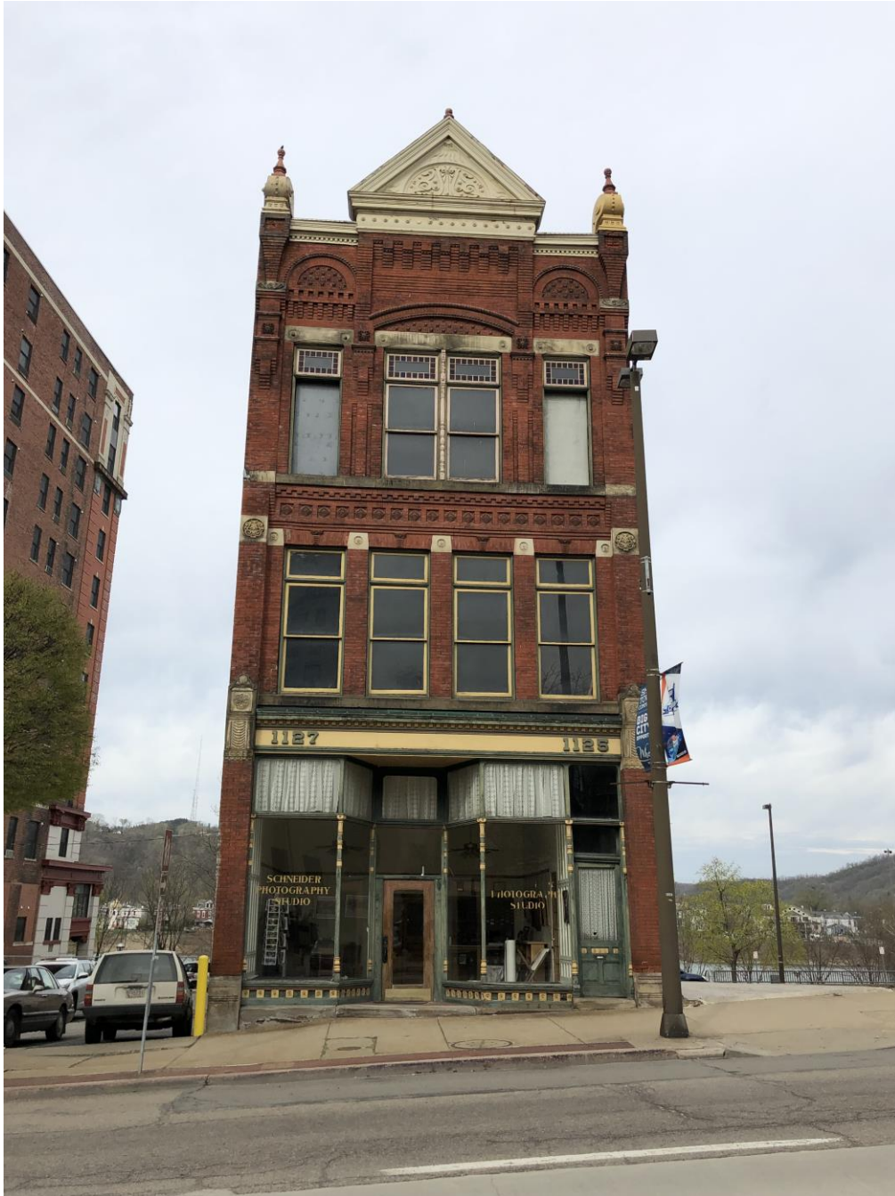
Photo 7. 1125-27 Main Street, facing west