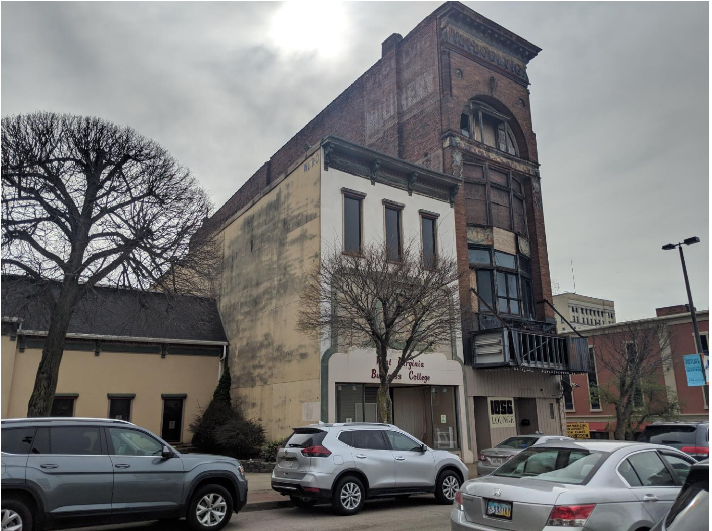
Photo 5. 1052-1056 Main Street, facing southeast