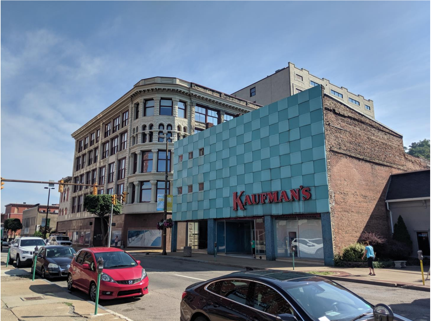
Photo 4. Main Street south of Lane 7 Alley, facing northeast