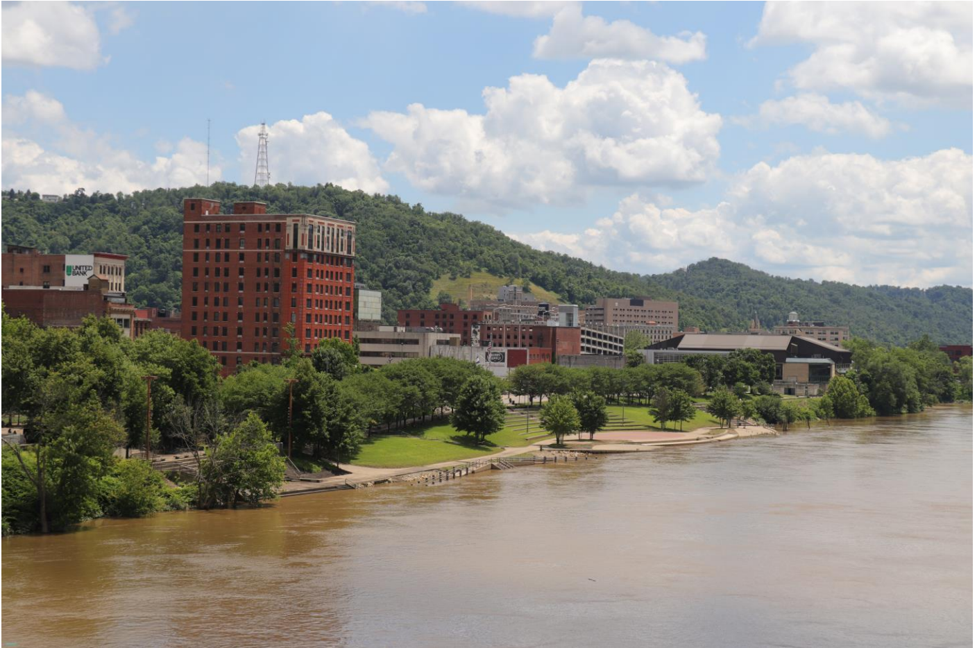
Photo 1. View of waterfront from Suspension Bridge, facing southeast