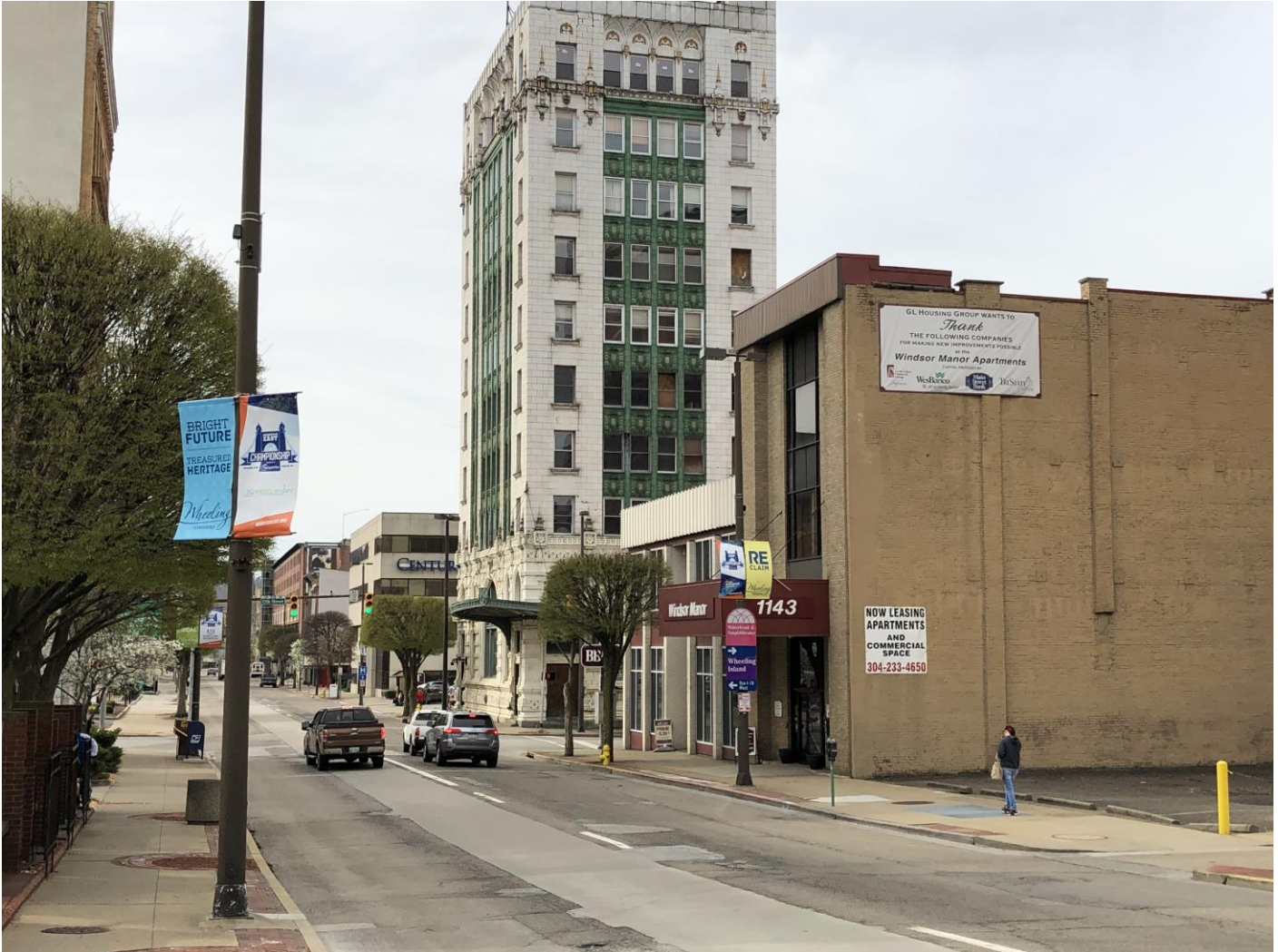
Photo 10. Market Street between 11th and 14th, facing southwest