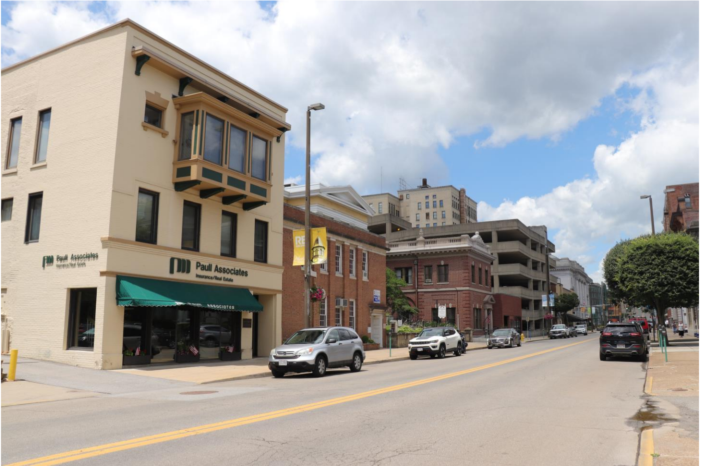
Photo 26. West side of Chapline Street, facing northwest