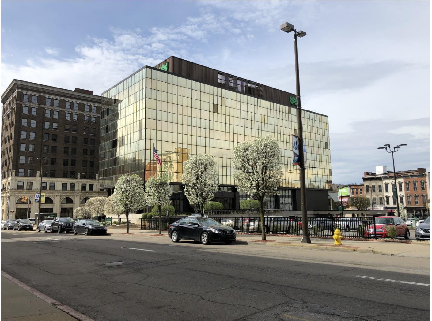
Photo 20. Wesbanco plaza, Market Street, facing southwest