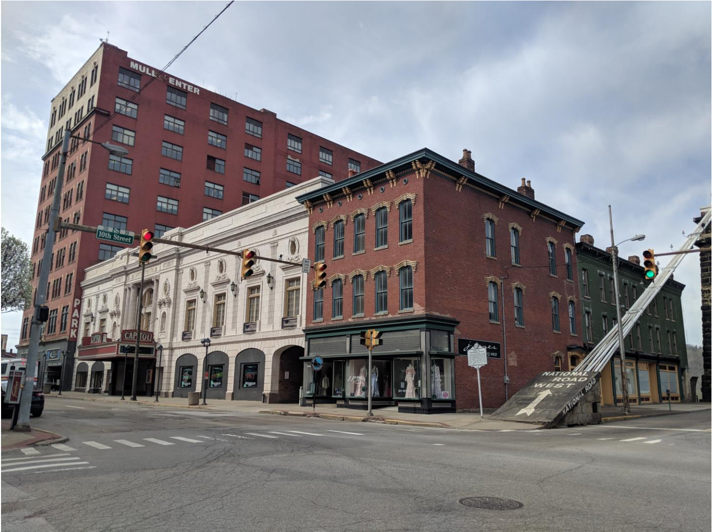
Photo 2. Main and 10th Streets, adjacent to National Road and Suspension Bridge, facing southwest