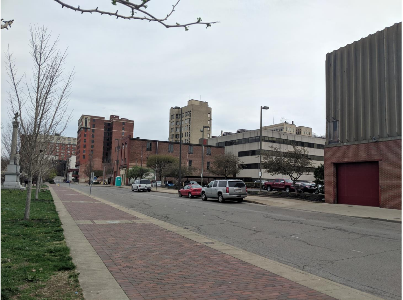
Photo 11. Water Street, facing northeast