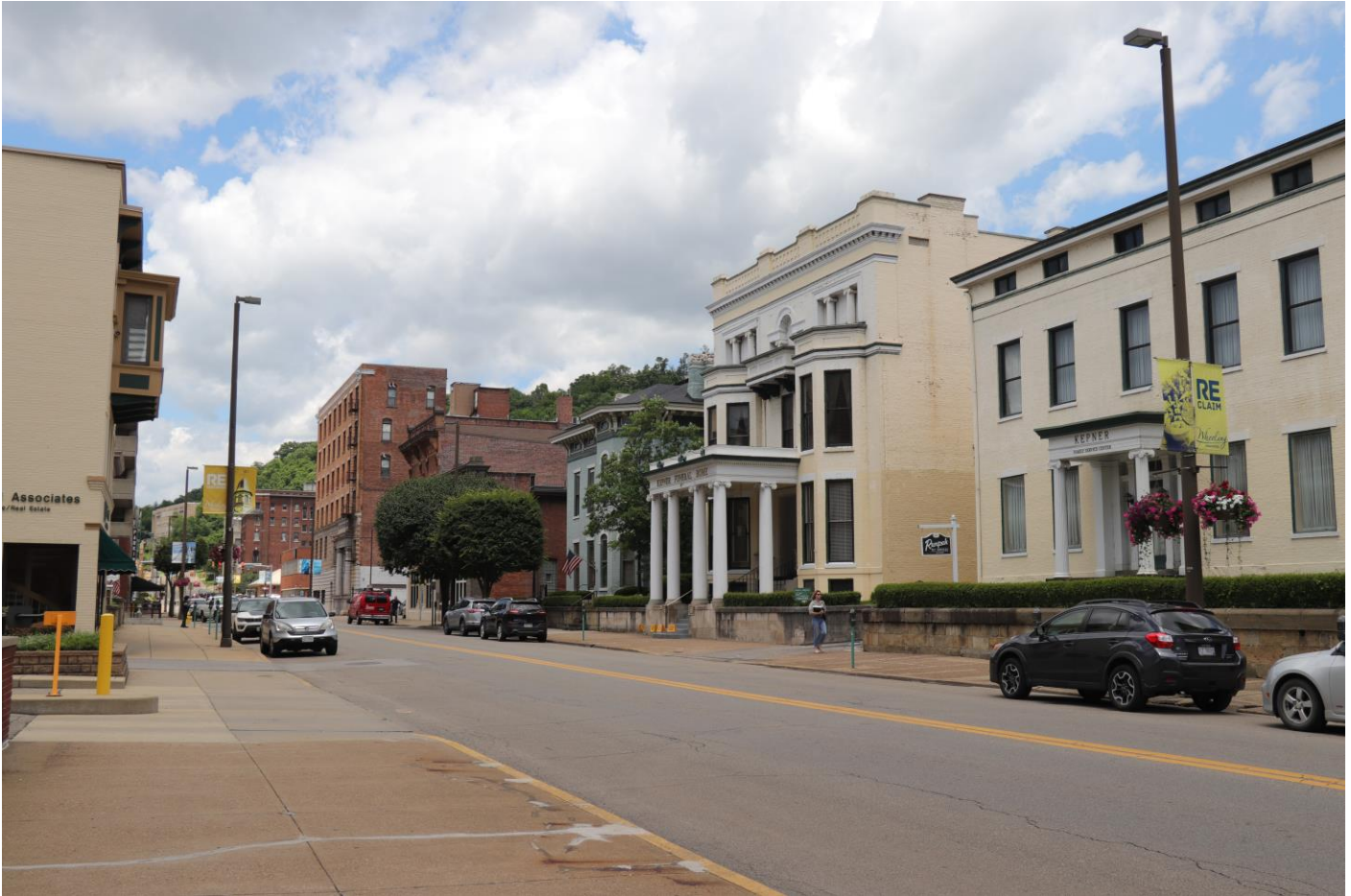
Photo 27. East side of Chapline Street, facing northeast