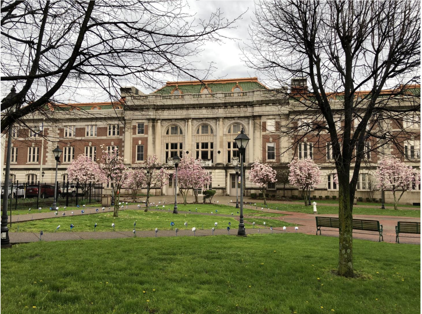
Photo 15. West Virginia Northern Community College plaza, facing south