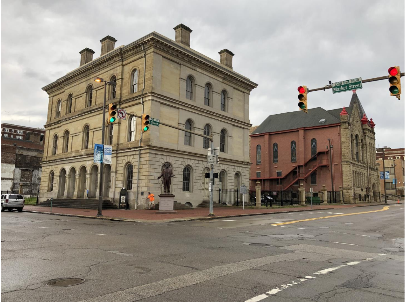
Photo 16. West Virginia Independence Hall at Market and 16th Streets