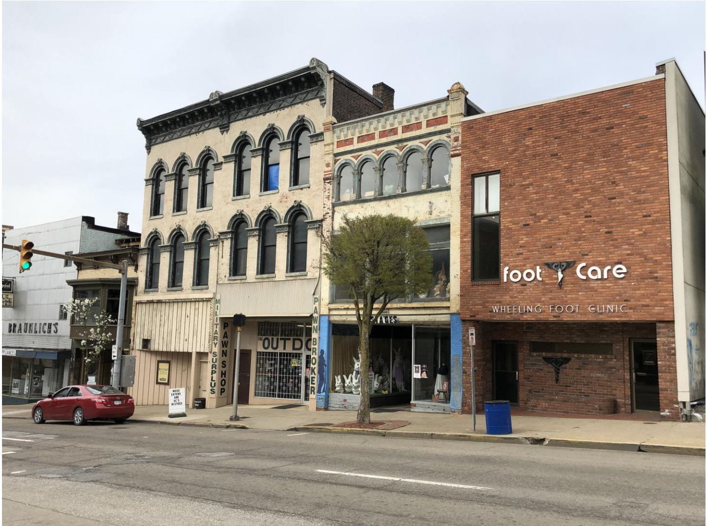
Photo 6. 1061-1073 Main Street, facing southwest