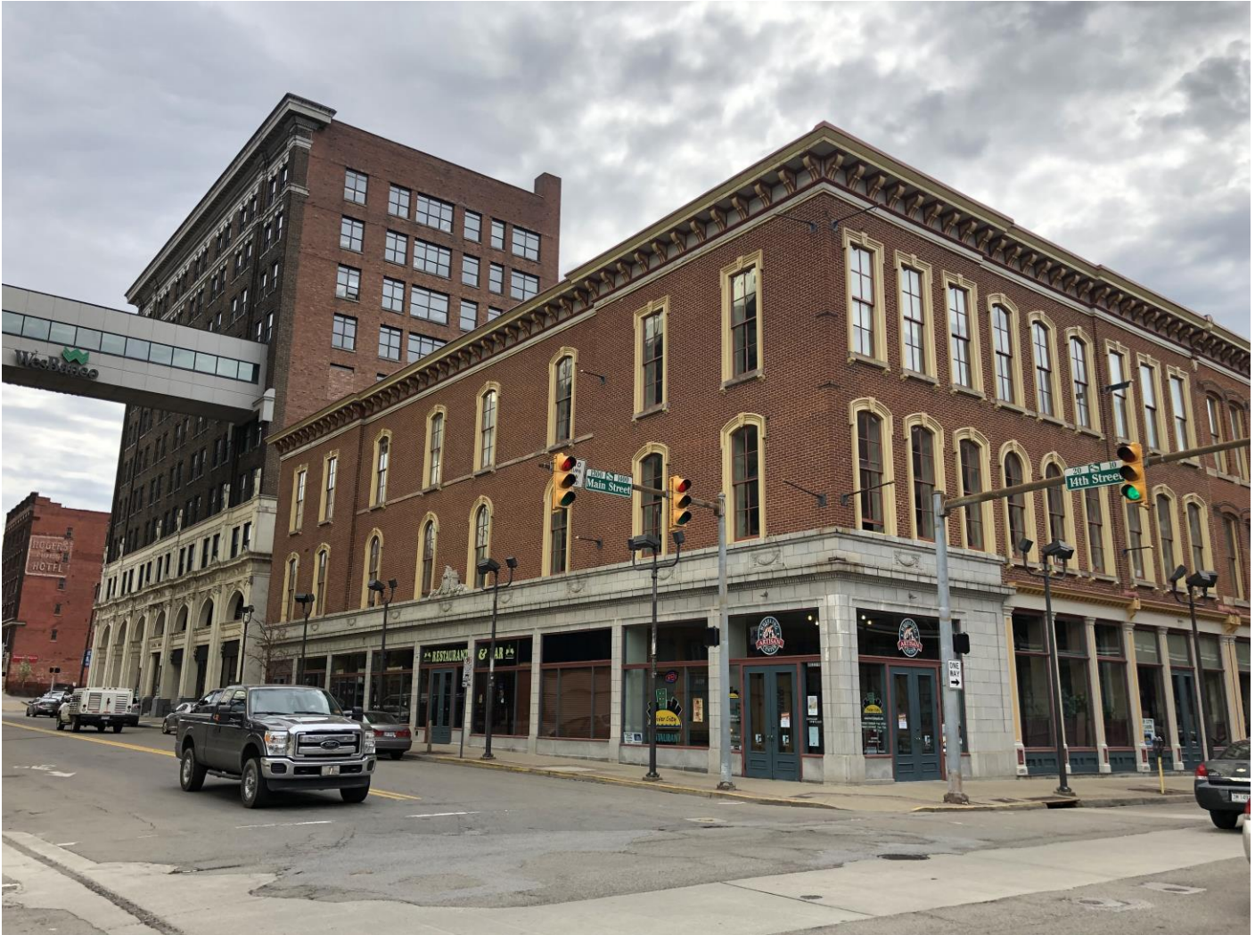
Photo 13. 14th Street at Main, facing southeast