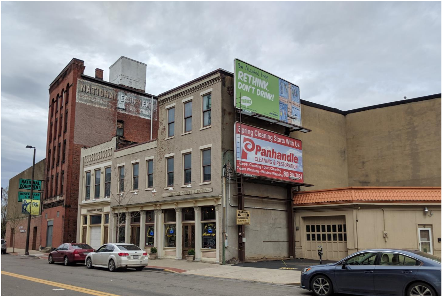
Photo 12. 14th Street at Main, facing northwest