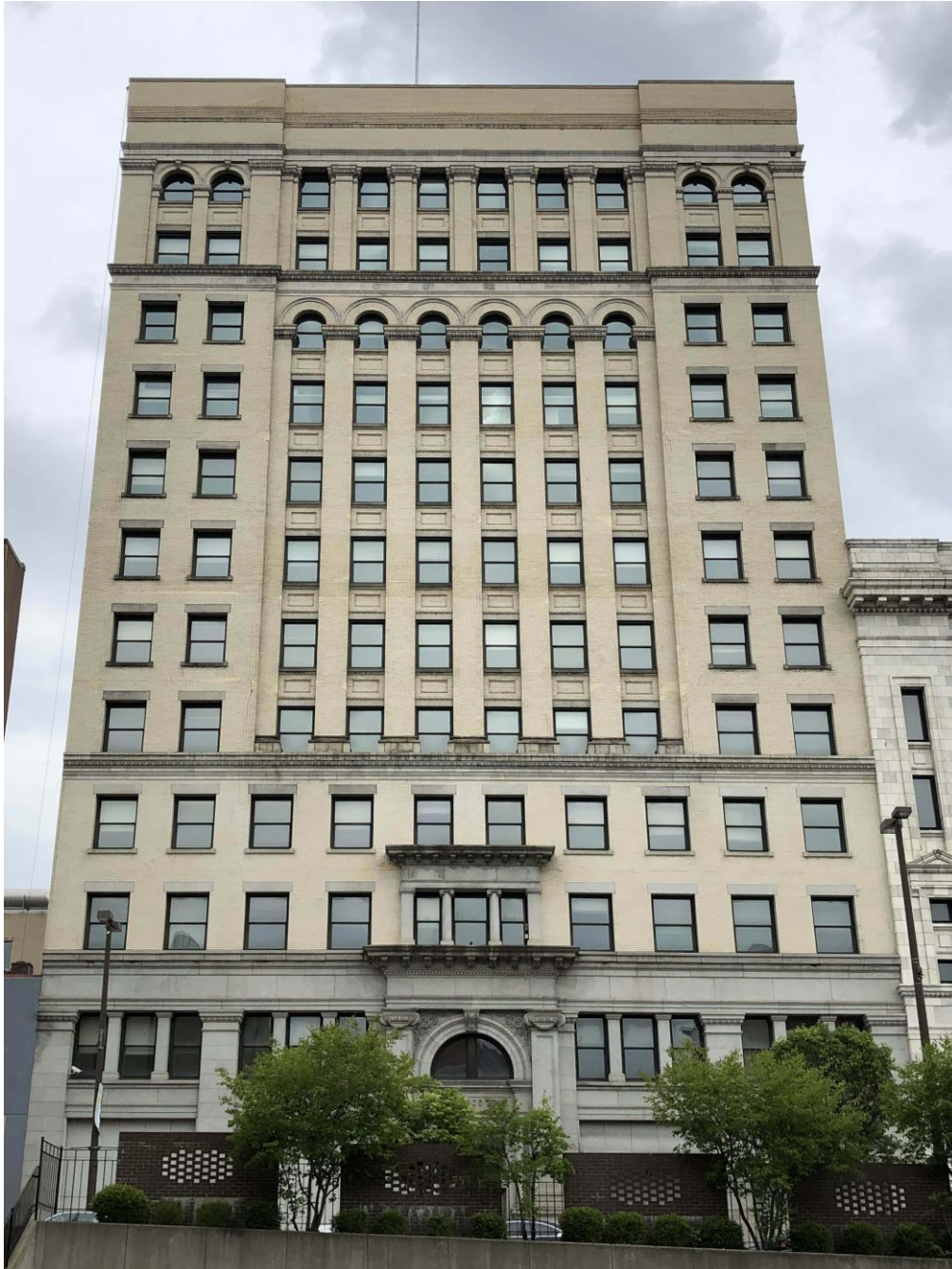
Photo 23. Schmulbach/Wheeling-Pittsburgh Steel Building, facing east