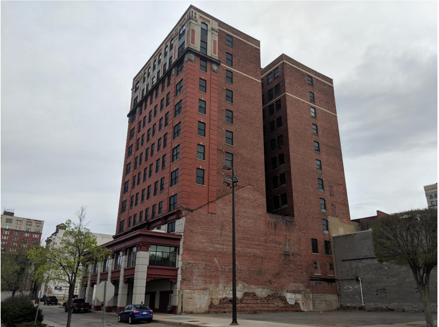
Photo 9. Rear of Windsor Manor from Heritage Port, facing northeast