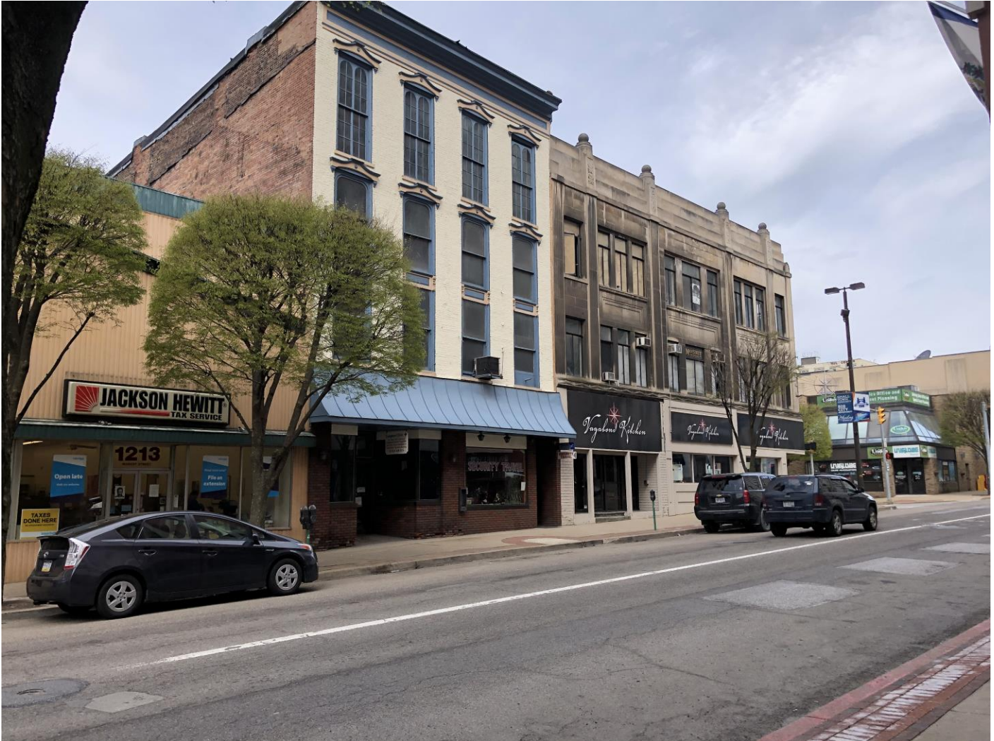
Photo 22. 1201-1215 Market Street, facing northwest