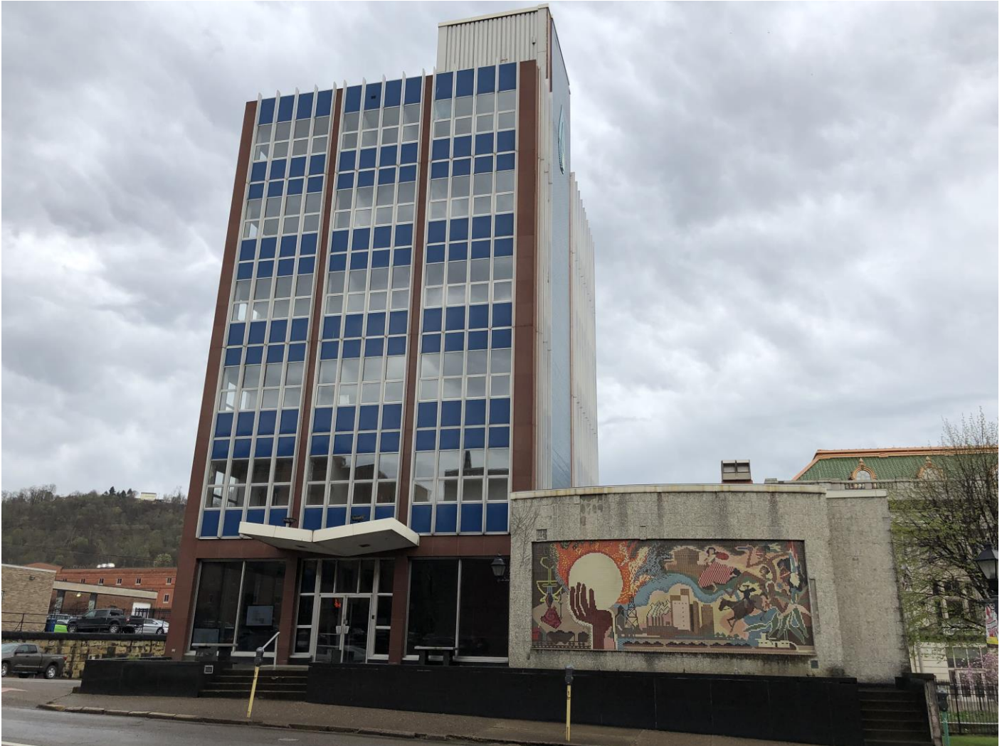
Photo 17. Columbia Gas of West Virginia Building, facing south