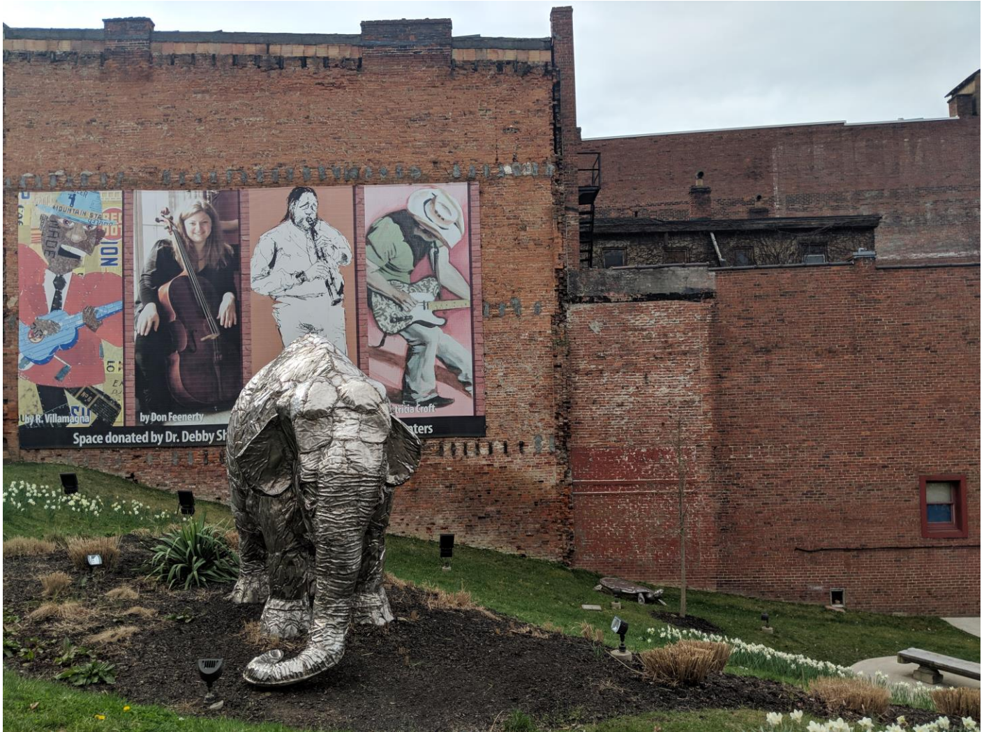
Photo 8. Heritage Port Park, facing south