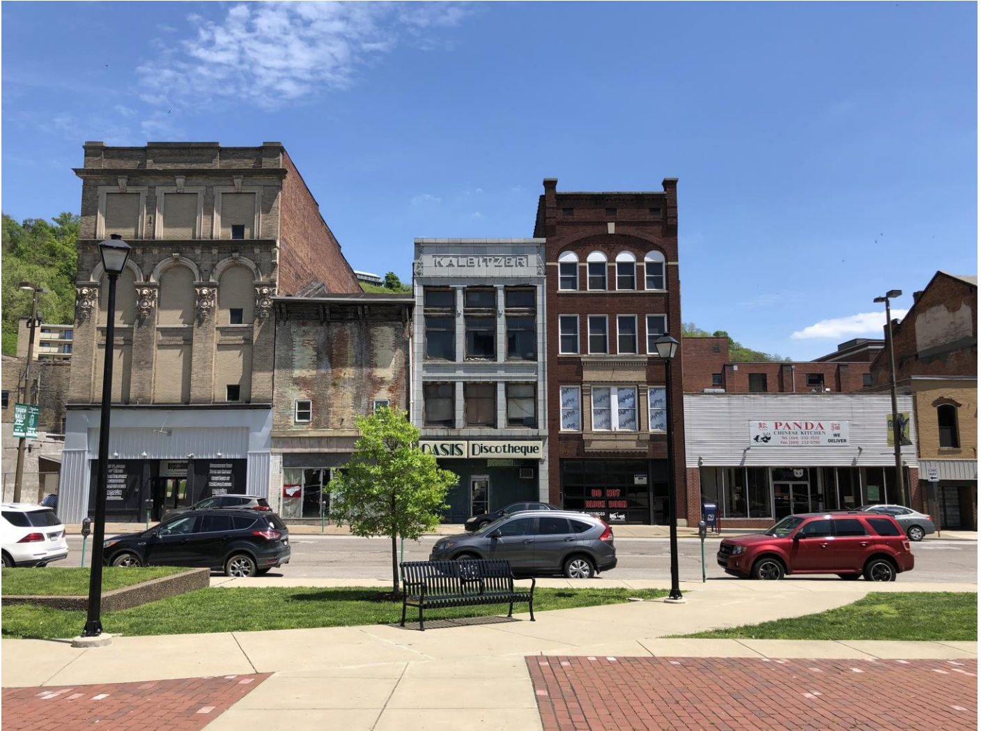
Photo 25. 1048-1056 Market Street, facing east