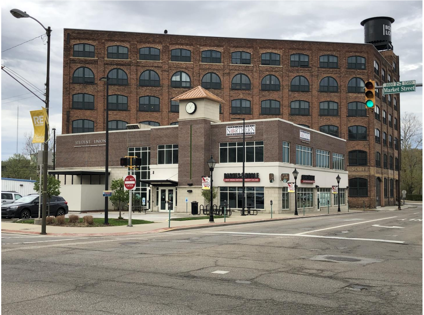
Photo 14. Market Street at 16th, facing southwest