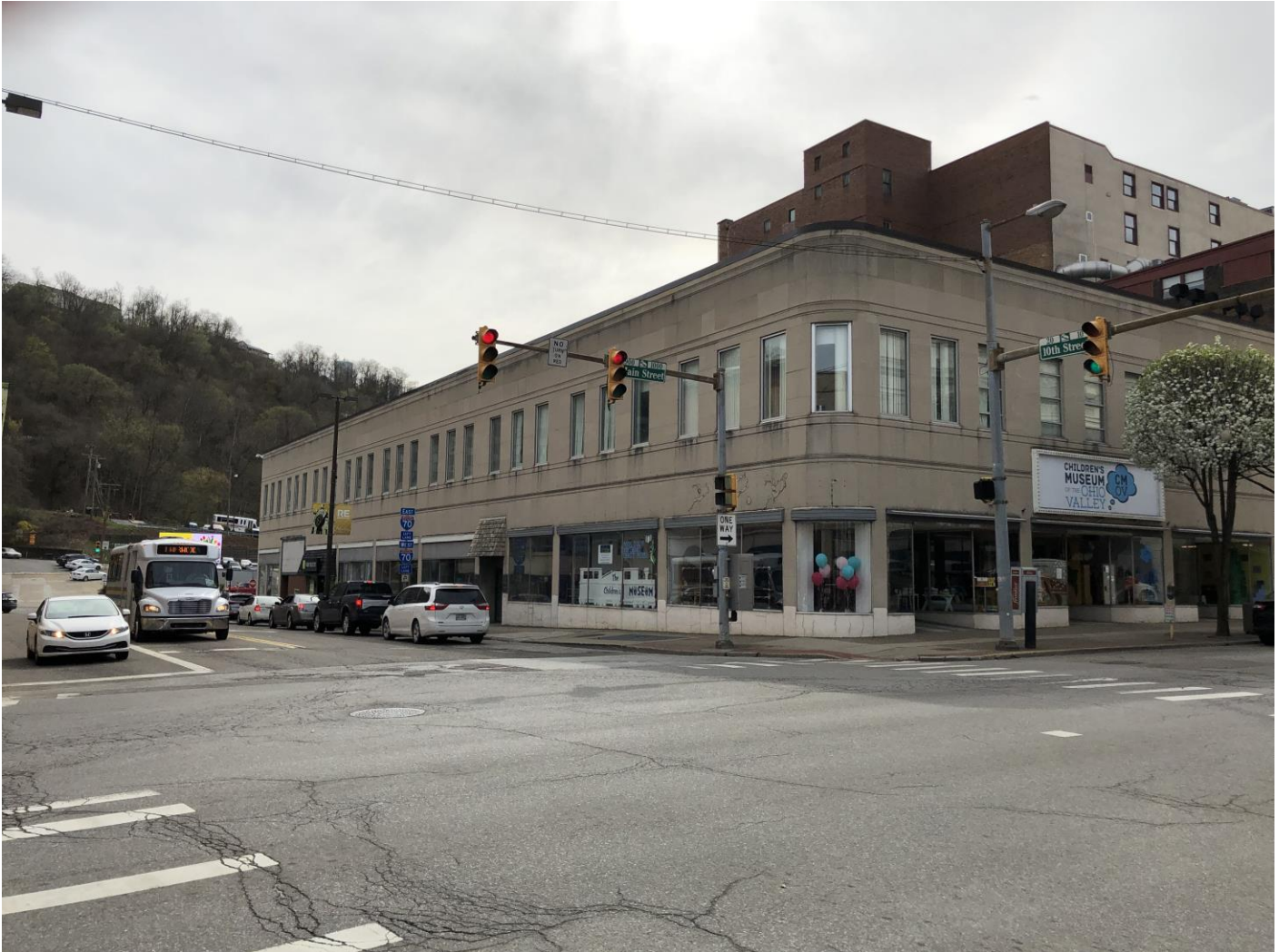
Photo 3. Main and 10th Streets, facing southeast